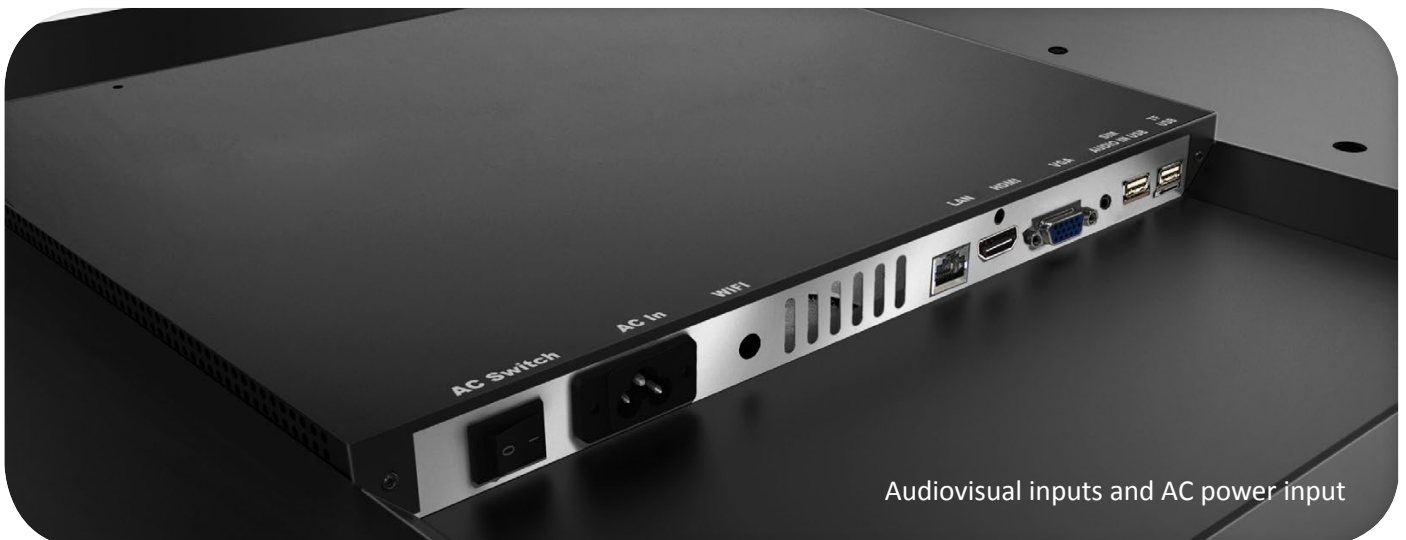
Audiovisual inputs and AC power input